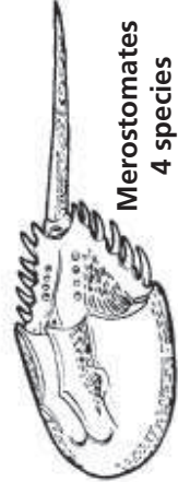
Merostomates 4 species