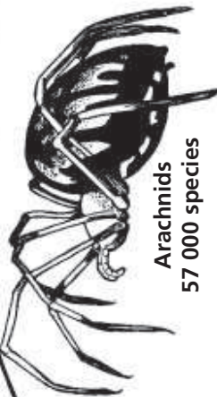
Arachnids 57 000 species