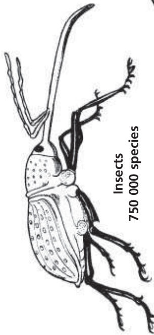
Insects 750 000 species