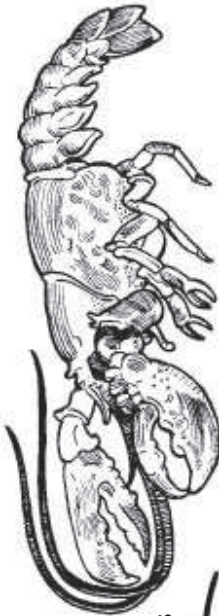
Crustaceans 35 000 species